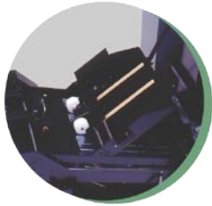
Hand marry, off-line feeding, and reject stations